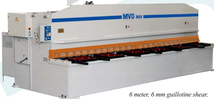
6 meter, 6 mm guillotine shear, HGM 6006