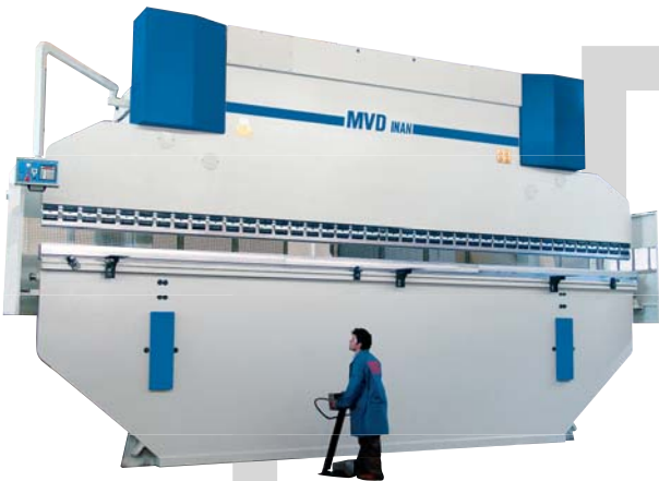
8 meter, 500 ton press brake, HAP 80/500