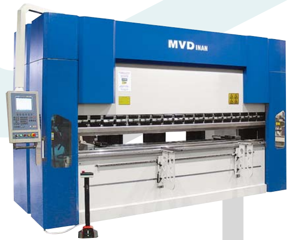
3.6 meter, 160 ton CNC press brake CNC HAP 35/160 with special cover