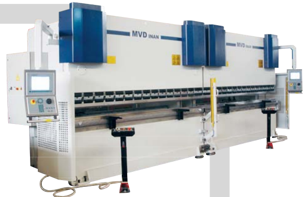
6 meter, 600 ton CNC tandem press brake CNC THAP 60/600